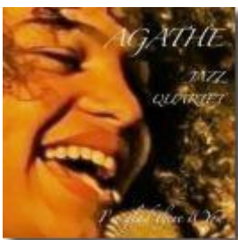
EP I'm Glad There is You (2007)