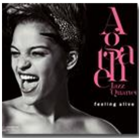
Feeling Alive (Neuklang, 2015)