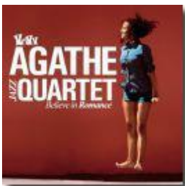
EP Believe in Romance (2010)