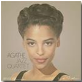
Vinyl collector limited (2014)